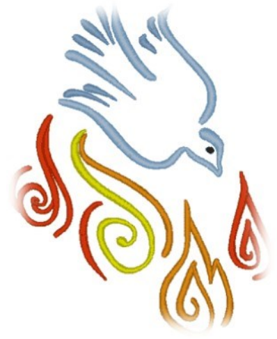
Men's weekend Closing June 24, 2018