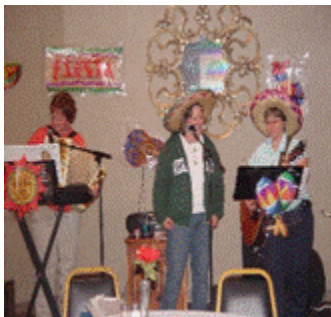
Our Lady of the Snows, Bellville Illinois Oct 2007, Fiesta Music

There are several chances to re-connect being offered: The National Encounter is in Washington DC, in July, and the Regional Encounter is scheduled for October at St. Meinrad in Indiana. Think about attending one or both. It's a wonderful way to kindle that flame that may be flickering in your heart. Need something closer to home? The monthly Ultreyas that are offered around the Diocese would love to have you make a personal appearance. What about the School of Leaders? We all can afford to learn new things about our movement. Our calendar is published on our website and on the back of the Rooster Crows each month. No apologies are necessary, no excuses accepted ... You'll be welcomed back with open arms and warm hearts. Come see us, soon.