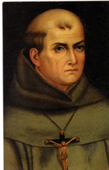
BLESSED JUNIPERO SERRA, PRAY FOR US.